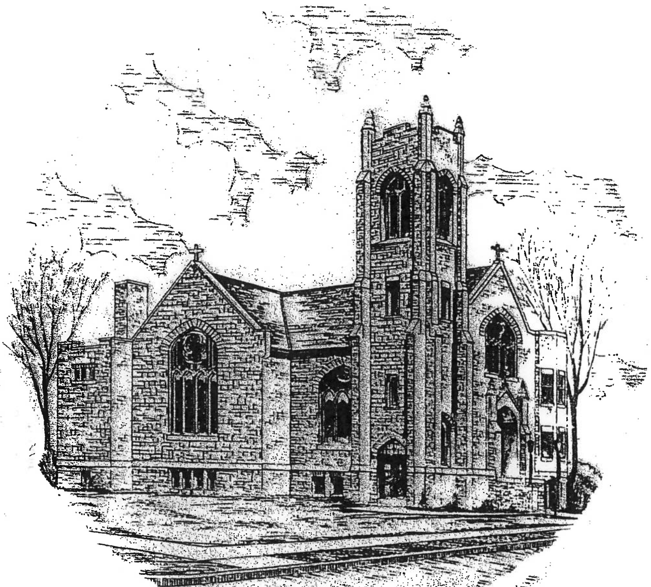
St. Paul's Lutheran Church Clyde, Ohio

Sunday, January 20, 2019 8:00 a.m. & 10:30 a.m.