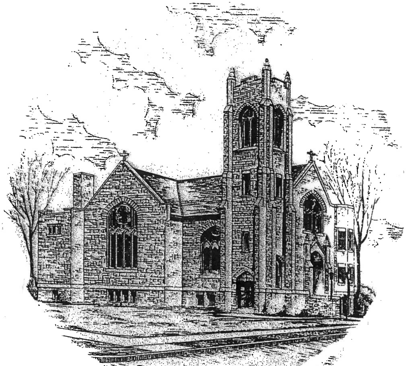
St. Paul's Lutheran Church Clyde, Ohio

Sunday, March 3, 2019 8:00 a.m. & 10:30 a.m.