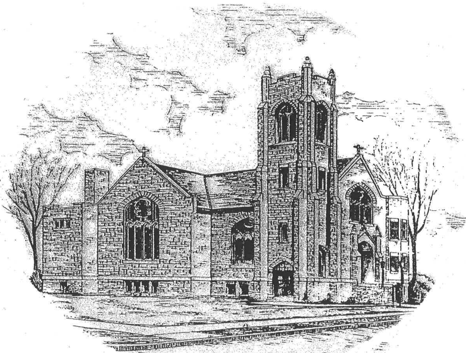
St. Paul's Lutheran Church Clyde, Ohio