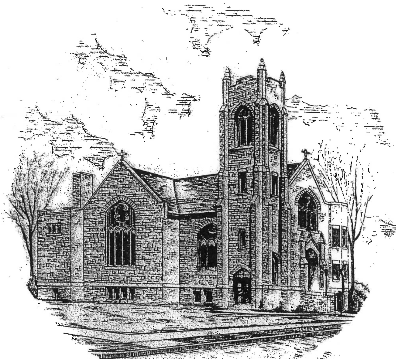
St. Paul's Lutheran Church Clyde, Ohio