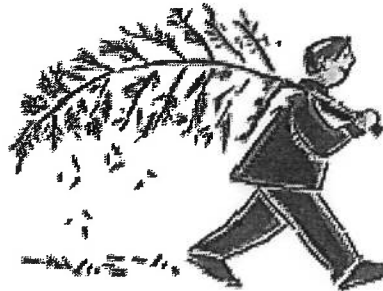
Removing of the Greens